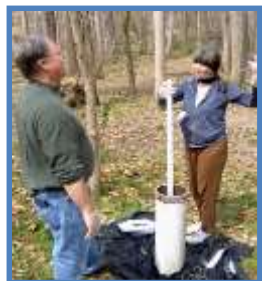
Phase II Start