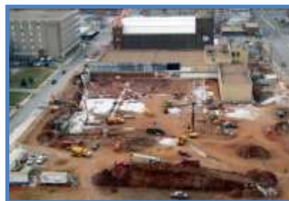
Institutional Controls In Place