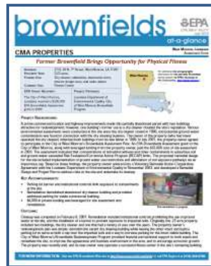
Brownfields At A Glance – July 2010