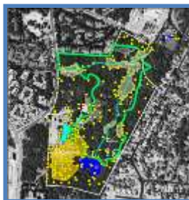
Phase II Complete