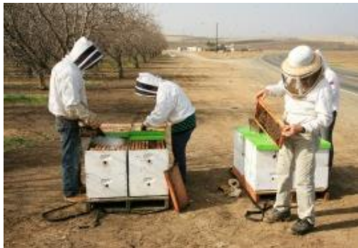
Managed pollinators in an orchard.

According to SFIREG’s Final Guidance for State Lead Agencies for the Development and Implementation of Managed Pollinator Protection Plans (June 2015), “The primary purpose of a state [MP3] is to reduce pesticide