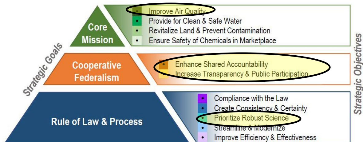
Figure 2. EPA Strategic Plan (FY 2018–2022)

vision of the program. The A-E strategic vision directly addresses a subset of the vision of the entire EPA program, as indicated by yellow ovals in the figure below: