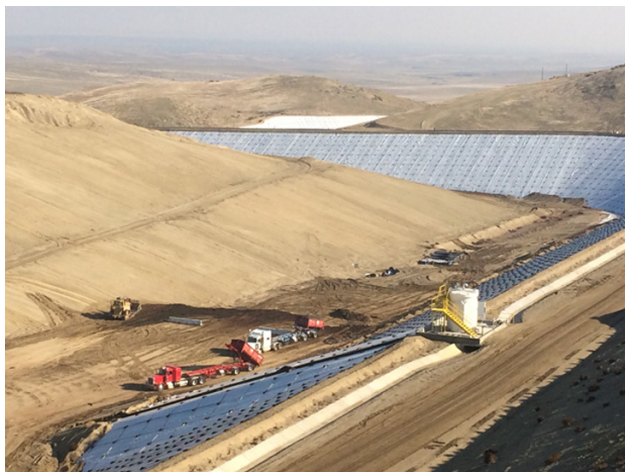
Kettleman Hills hazardous waste landfill.

The proposal, if finalized by EPA, would require regular sampling of groundwater and air at the facility, and includes inspection and maintenance, recordkeeping and reporting requirements, an emergency response plan, and plans and funding for eventual safe closure and post-closure maintenance of the facility.