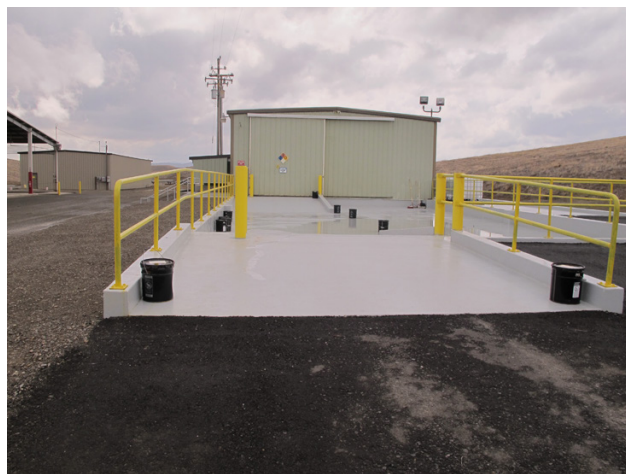
PCB storage building at Kettleman Hills facility.

Polychlorinated biphenyls, or PCBs, are a group of toxic chemicals that were widely used in electrical equipment because of their insulating and nonflammable properties. Congress banned the manufacture of PCBs in the United States in 1976 because of their potential environmental and public health hazards. Exposure to high levels of PCBs can harm the human immune, reproductive and nervous systems, and may cause cancer.