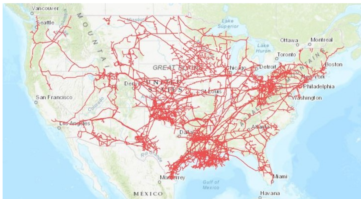
Figure 8-2. Interstate pipelines in the contiguous United States