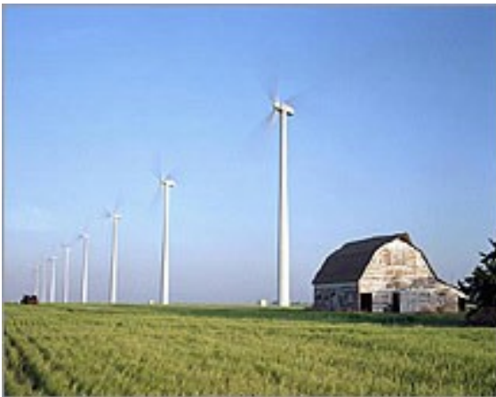
Figure 1: Wind turbine farms.

Wind turbines can be used as Auxiliary and Supplemental Power Sources (ASPSs) for wastewater treatment plants (WWTPs). A wind turbine is a machine, or windmill, that converts the energy in wind into mechanical energy. A wind generator then converts the mechanical energy to electricity 1 . The generator is equipped with fan blades and placed at the top of a tall tower. The tower is tall so that high wind velocities can be easily harnessed without being affected by turbulence caused by obstacles on the ground, such as trees, hills, and buildings. Individual wind turbines are typically grouped together to give rise to a wind farm ( Figure 1 ). A single wind turbine can range in size from a few kilowatts (kW) for residential applications to more than 5 Megawatts (MW) 2 . Many wind farms are producing energy on a megawatt (MW) scale, ranging from a few MW to tens of MW.