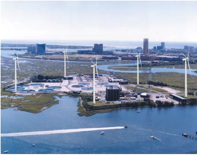
Figure 4: ACUA Wastewater Treatment Plant wind farm in Atlantic City, New Jersey.

To encourage the use of renewable energy resources, the town of Browning, Montana, and the Blackfeet Indian Tribe have installed four Bergey Excel 10 kW wind turbines adjacent to the town's sewage treatment plant. The turbines provide about one-quarter of the plant's electricity, displacing energy bought from the grid. In the City of Fargo, North Dakota, the installation of a 1.5 MW wind turbine to provide 85% of the annual electricity used by the city's wastewater treatment plant is being considered. The Fargo wind turbine is estimated to cost $2.4 million and could save the plant about $203,000 in energy costs annually 16 .