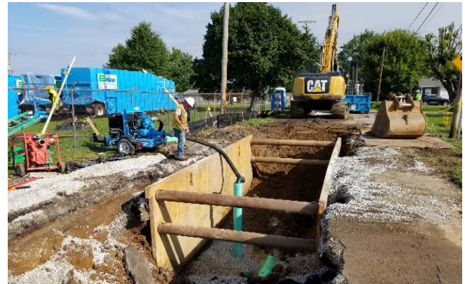
Photo #4: View of dewatering well, blue frac tanks, trench excavation, & new sewer pipe