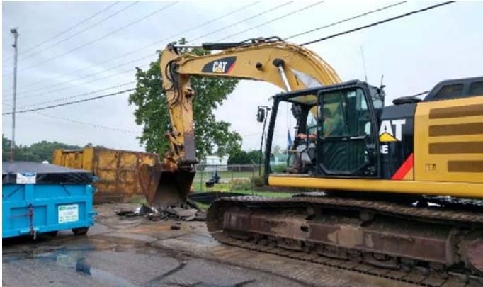
Photo #1: Starting excavation activities at far south end of project area (sewer manhole #250040)