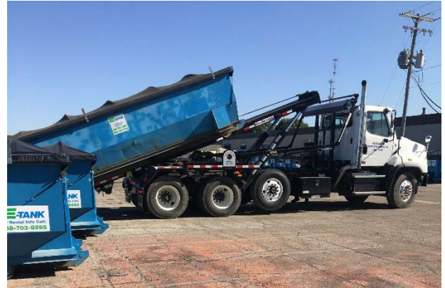
Photo #2: View of tarp covered soil filled roll-off box being dropped at the site until lab results received