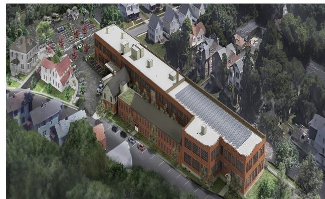
1 - Picture of Swift Factory After Redevelopment

The Swift industrial building at 10 Love Lane, once an economic driving force in the neighborhood, was acquired in 2010 by Community Solutions, a non-profit that aims to achieve a lasting end to homelessness that leaves no one behind. At the time of the purchase, contamination from the site's industrial past as far back as 1887 remained a challenge. Asbestos in building materials as well as lead, petroleum, and volatile organic compounds in soil and groundwater needed to be addressed. In 2010, the Connecticut Department of Economic and Community Development used $3,000 of its EPA Brownfields funding to help assess the types and amounts of contamination at the site. In 2018, the state provided $205,000 from its EPA Brownfields Revolving Loan Fund to address ground water and soil remediation at the factory. The state also provided its own funding with a $600,000 grant and a $3 million loan to help finance the remainder of the site cleanup and redevelopment. The DECD loan was used to repair and replace the roof in 2015 followed by demolition and building abatement in 2018. Demolition, abatement and remediation activities were complete in the summer of 2019 with final project completion expected in the spring of 2020. Tenants are expected to move in in early 2020, all of whom align with Community Solutions' mission to create a just and equitable society where homelessness is never inevitable, inescapable, or a way of life.