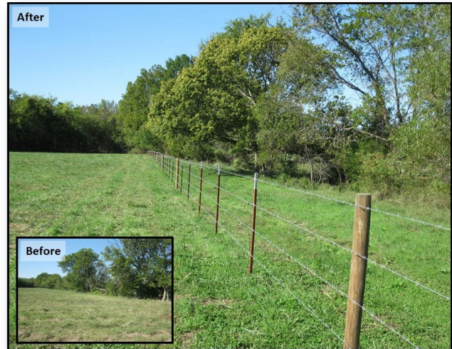
Figure 2. Cross fencing installed near East Rock Creek in Marshall County.

The biological function of East Rock Creek was reevaluated by TDEC in 2015. Macroinvertebrate sampling of East Rock Creek provided an improved TMI of 34 (passing score is 32), with an increase in intolerant species (indicating improved water quality). As a result of the 2015 TMI, East Rock Creek was removed from the Tennessee’s 2018 list of impaired waters for nitrate, siltation, and habitat alterations. (Tennessee has narrative nutrient and