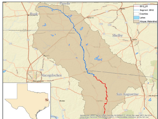
Figure 1. Attoyac Bayou is in the Upper Neches River watershed in eastern Texas.

In July 2010, the TSSWCB partnered with local stakeholders and TWRI to begin developing a WPP for Attoyac Bayou. The stakeholder group that led the WPP development consisted of representatives from agricultural and silvicultural producers, wildlife interests, soil and water conservation districts (SWCDs), the poultry industry, Commissioner's courts (i.e., county governments), cities and various other interests in the