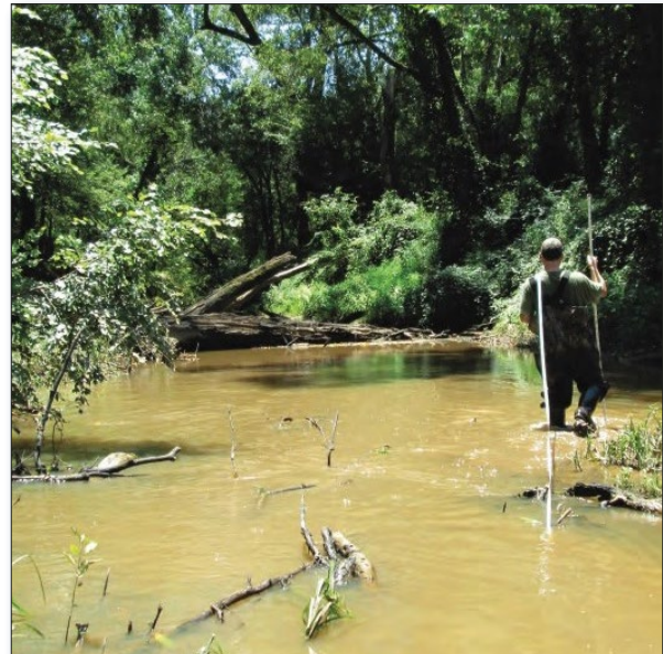
Figure 3. Water quality monitoring will continue to be used to track water quality on Attoyac Bayou.

Assessment data collected from 2007 to 2014 show that the long-term E. coli geometric means have dropped below the geometric mean water quality standard of 126 colony-forming units per 100 milliliters in a portion of Attoyac Bayou. This area of the bayou now supports contact recreation. Therefore, TCEQ removed a portion of Attoyac Bayou from the CWA