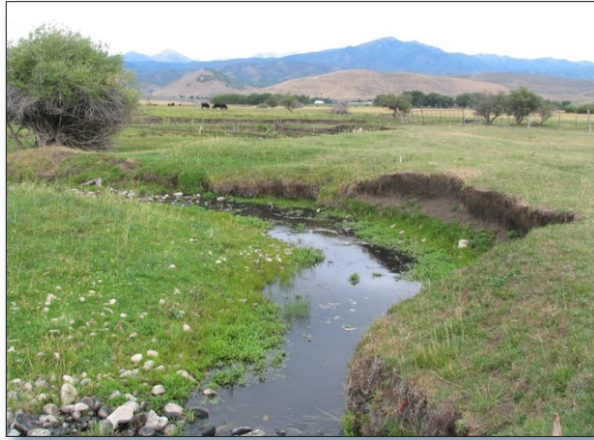
Figure 2. Main Creek in 2013, before restoration.

way to lower water temperature and reduce E. coli and total phosphorus loading to Main Creek and Deer Creek Reservoir. Streambanks are characterized as highly erodible due to lack of riparian vegetation and access by livestock. The lack of native woody vegetation along the creek also allowed for higher in-stream temperature due to a lack of shading.