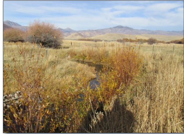
Figure 3. Main Creek in 2017, after restoration.

As a result of the project implementation, notable improvements have been observed within the Main Creek watershed. These improvements include significant loading reductions of E. coli and nutrients. The amount of fine sediment in the creek has decreased and the vegetative cover has increased. The channel width has narrowed and pool depth has increased, leading to decreased water temperatures and a vast improvement in the biological composition in the restored sections. Data show that Main Creek met water quality standards (WQS) for temperature beginning in 2014 (Table 1), prompting Utah to remove it from the 2014 CWA section 303(d) list of impaired