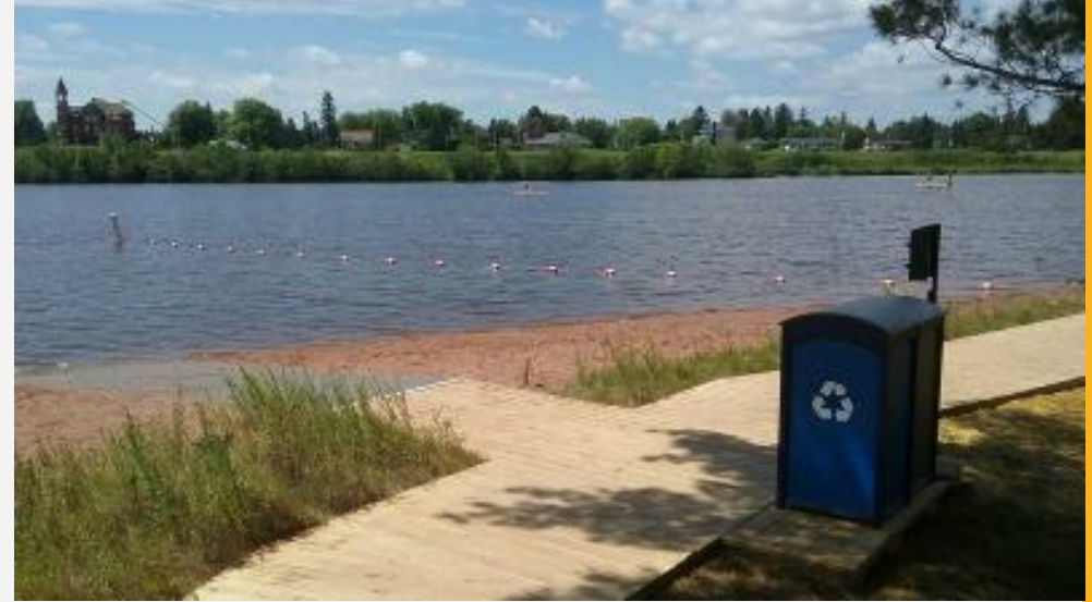
Barkers Island Beach Restoration.