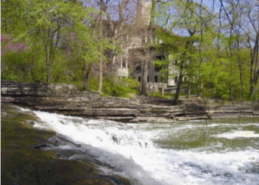
Henry Ford Estate Dam