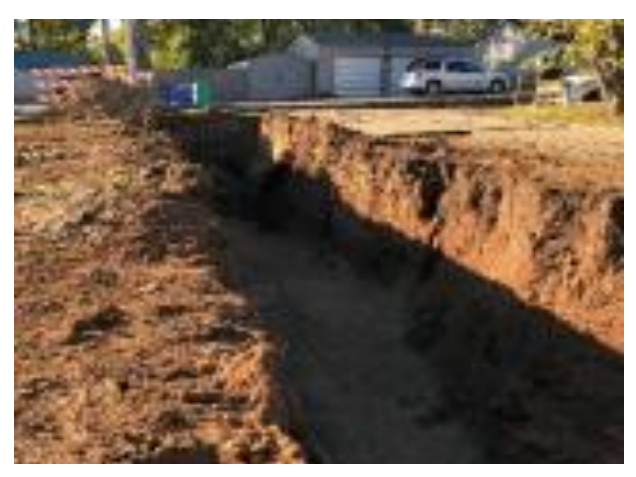
Trench where 245 feet of the old sewer line and 340 tons of contaminated soil were dug out on the former Amphenol site north of Hamilton Avenue in in October 2019.