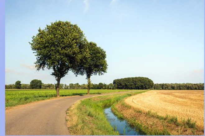
Many roadside ditches