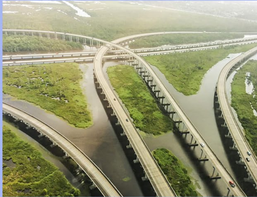
Wetlands with manmade structures that allow surface connection like these in the Mississippi River Delta region of Louisiana