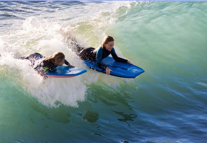
A tidally-influenced waterbody like the territorial waters of the Pacific Ocean off of California