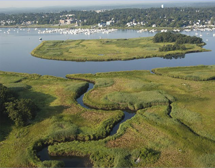
Wetlands that abut a traditional navigable water like these near Ram Island in Massachusetts