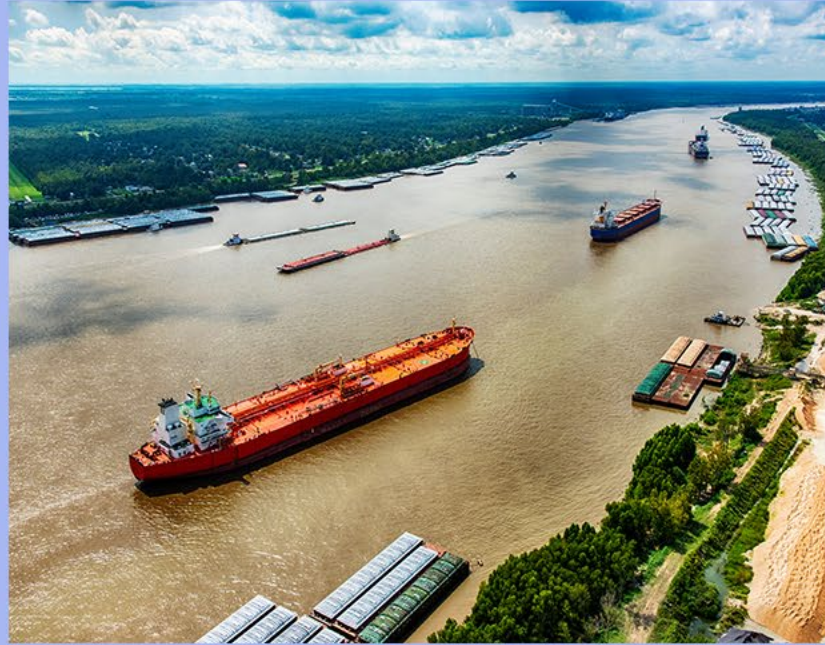
A navigable water like the Mississippi River