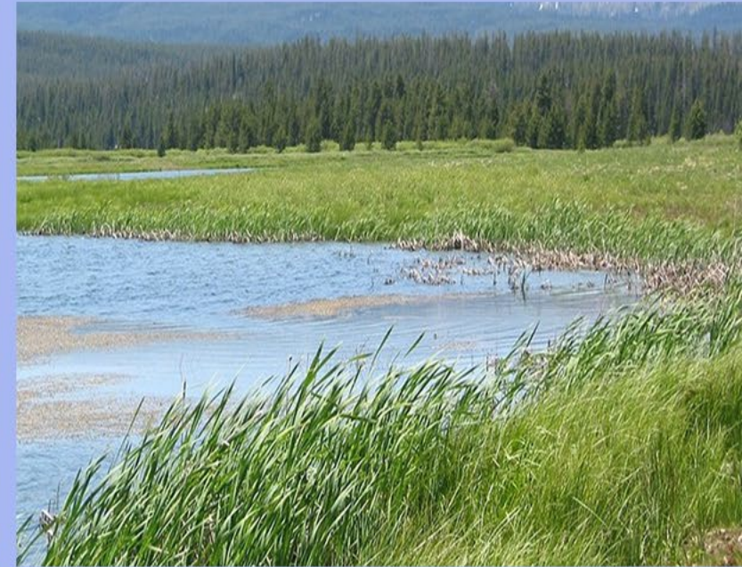
Wetlands that are adjacent to a traditional navigable water like these in Wyoming next to the Snake River