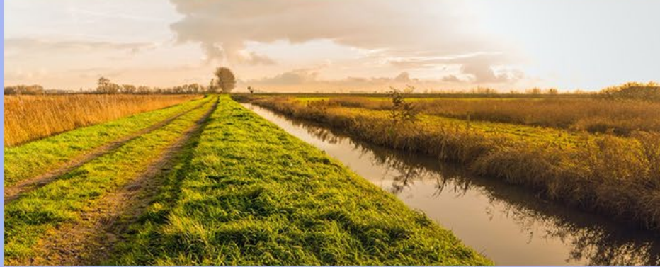
Many farm ditches