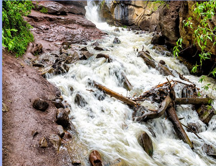
A snowpack-fed intermittent tributary like Hayes Creek in Colorado that contributes surface flow to the Crystal River