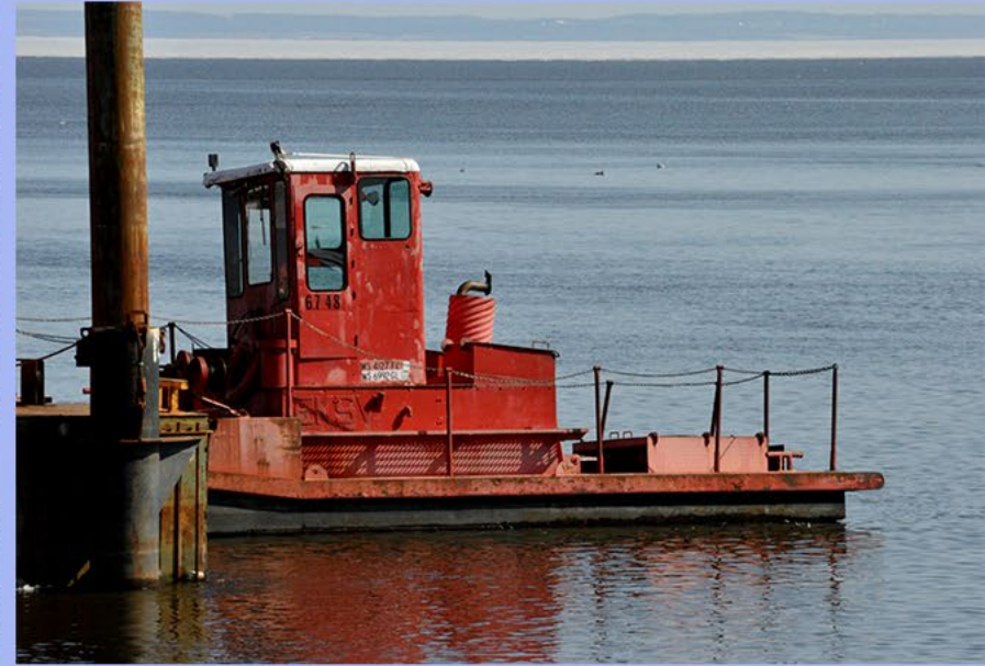
A water used for interstate commerce like Lake Winnebago in Wisconsin