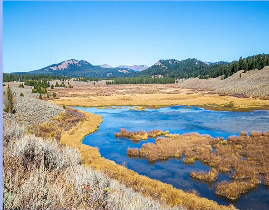
A pond that contributes surface flow to a traditional navigable water like Christian Pond in Wyoming