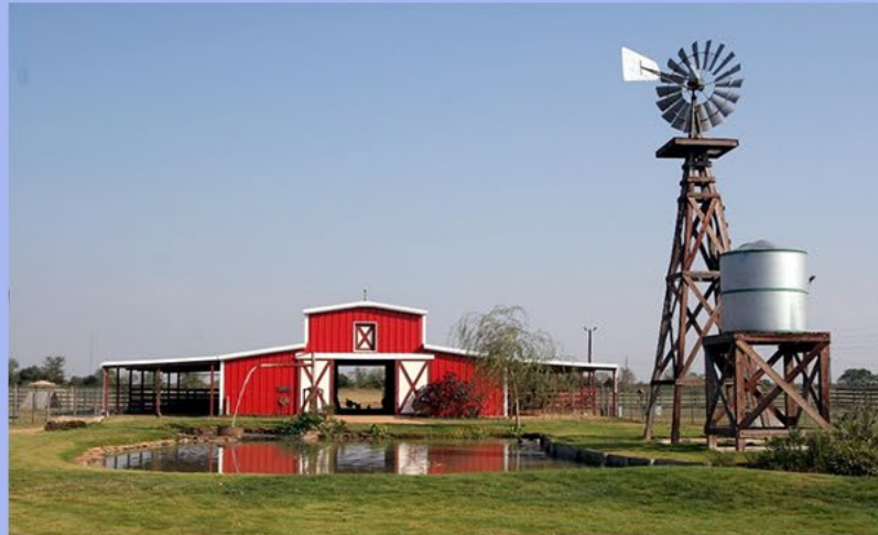
Farm and stock watering ponds constructed in upland