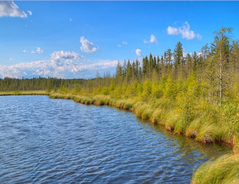
A lake that contributes surface flow to a traditional navigable water like Lake Bemidji in Minnesota