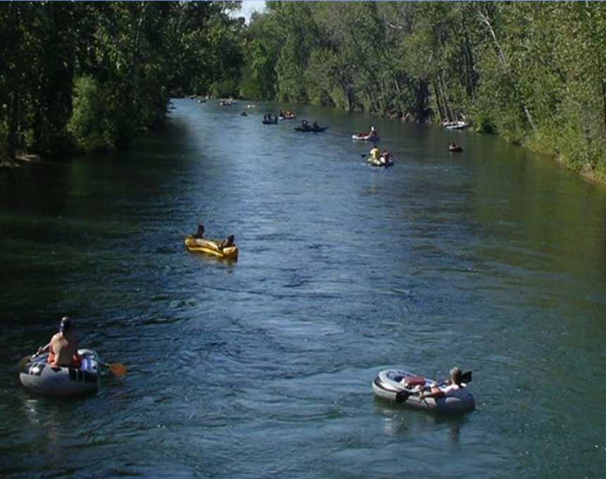
A perennial tributary like a section of the Boise River in Idaho that contributes surface flow to the Snake River