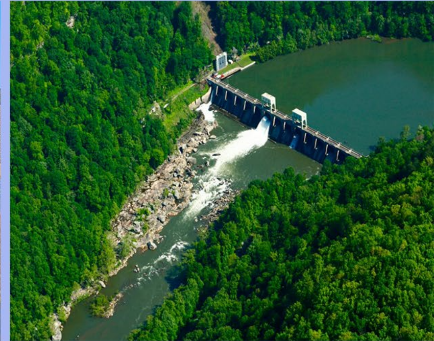
An impoundment that contributes surface flow to a traditional navigable water like Hawks Nest Lake in West Virginia