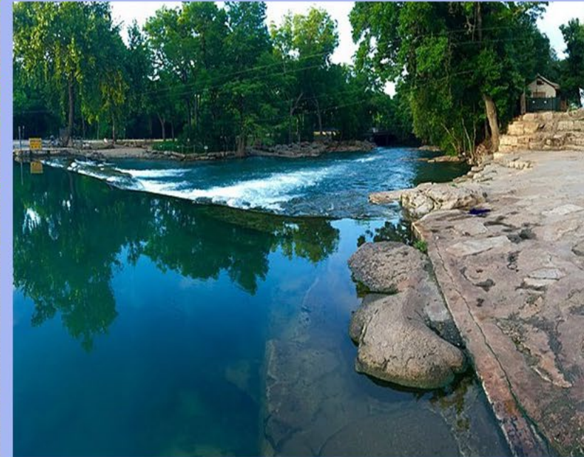
A perennial tributary like the San Marcos River that contributes surface flow to the Guadalupe River