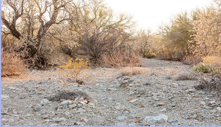
Dry washes and ephemeral streams