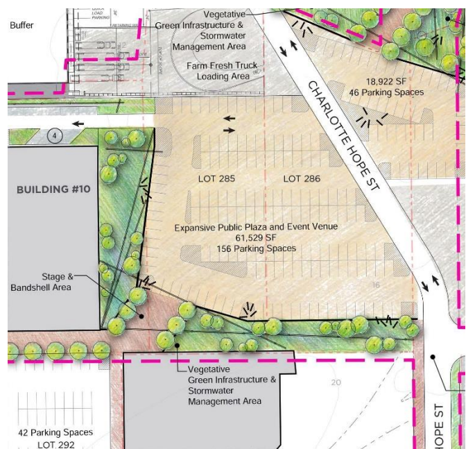
Site design from the Charlotte Hope Plaza Plan illustrating multi-use event space and alleyway improvements.

The City of Providence will use the Charlotte Hope Plaza reuse plan to help realize the community-desired improvements while accommodating the needs of new and existing businesses in the area.