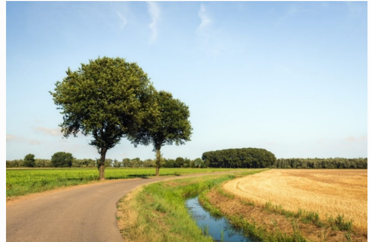
The ditch exclusion includes many roadside ditches as well as many farm ditches.