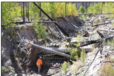
Pueblo of Santa Clara

Hyatt Regency Tamaya 1300 Tuyuna Trail Santa Ana Pueblo, NM