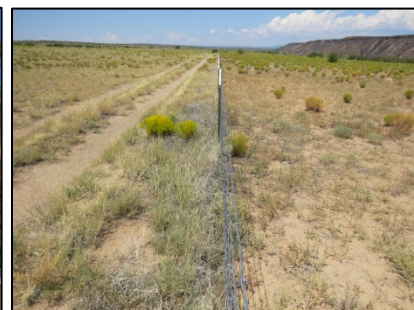
Pueblo of Santa Ana

The U.S. EPA's Tribal NPS Program and the Pueblo of Santa Ana invite you to save the date for a training workshop that will cover both technical and programmatic training topics to support tribal NPS management efforts. This three-day workshop will include classroom-based training sessions and field visits to local water quality restoration sites. Attendees will have an opportunity to present on their NPS program experiences, network with other tribal NPS coordinators, and learn from other water quality professionals on a range of NPS topics. Potential agenda topics include: