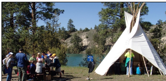
Confederated Salish & Kootenai Tribes