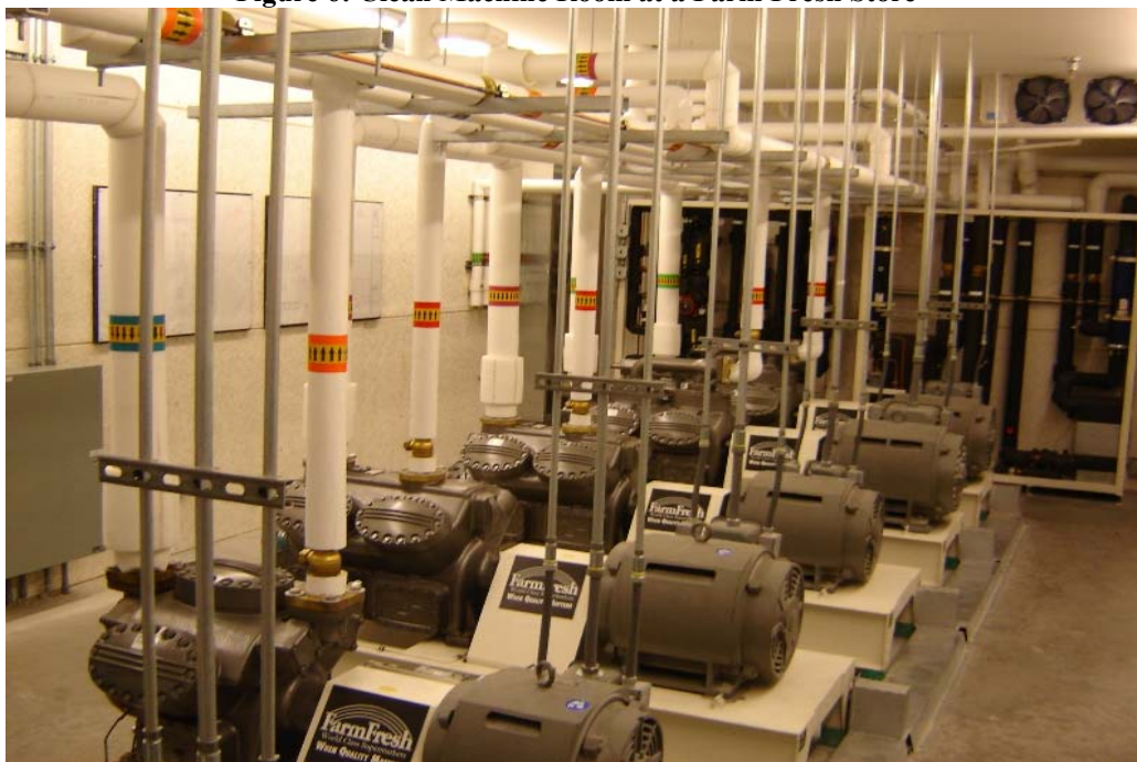
Figure 6: Clean Machine Room at a Farm Fresh Store

A clean and uncluttered mechanical room provides a safe and accessible environment for service technicians and sends a strong signal about a store's commitment to equipment maintenance and leak reduction. Dirty refrigeration compressor racks, air-cooled condensers, remote headers, and walk-in evaporator coils make it difficult for technicians to spot leaks and create the impression that a store is not concerned with the maintenance of equipment. Motivation of service technicians is key to the success of a leak reduction program. To instill a sense of pride in your service technicians, refrigeration racks as well as the entire mechanical room should be kept as clean as possible. Compressor racks and their components should be free of oil and dirt. Corrosion on steel components should be removed and components painted with a rust-inhibiting paint to help prevent future corrosion. Mechanical rooms should not be permitted to be used as storage areas by the store personnel - besides the obvious safety concerns, the clutter reduces a technician's productivity, adds to his or her frustration, and increases maintenance costs. As a result, equipment and mechanical rooms should be cleaned at least annually. Oil spills and other substantial messes should also be cleaned as they occur.