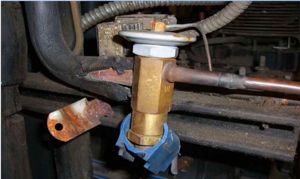
Figure 4: Image of broken clamp caused by vibrations