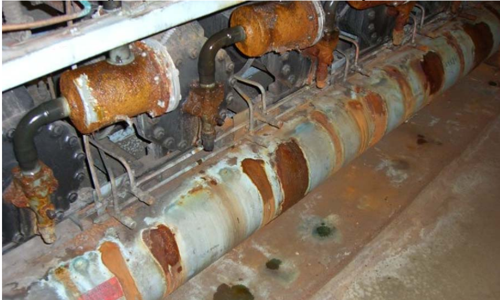
Figure 2: Excessive corrosion on rack components