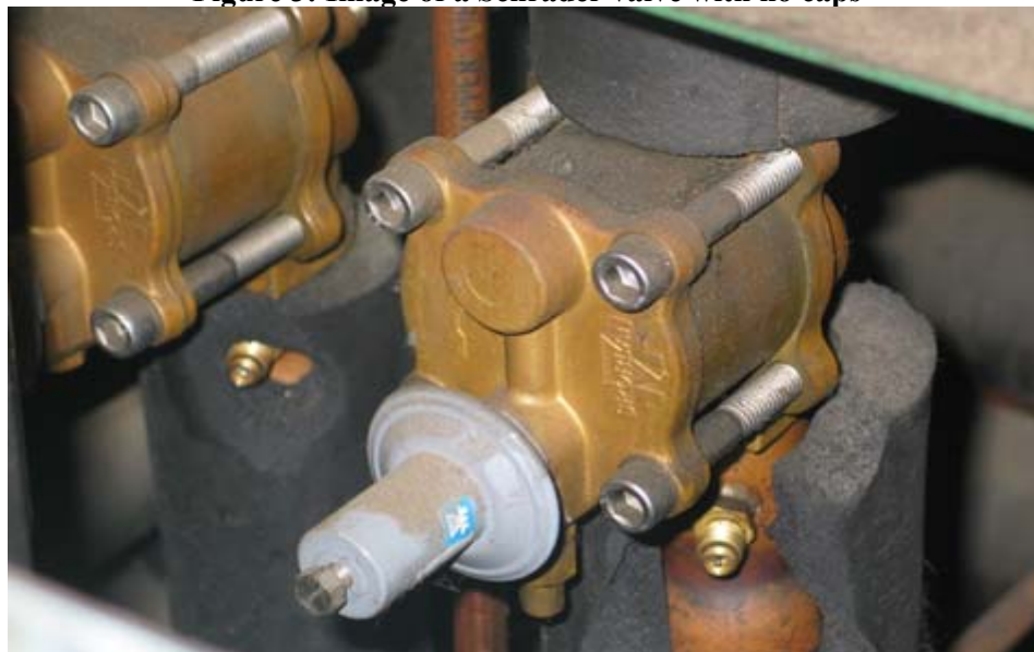
Figure 3: Image of a Schrader valve with no caps