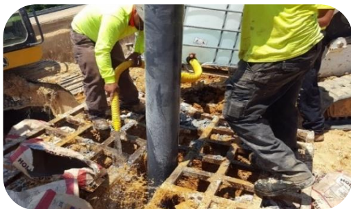
Hydrating bentonite to seal a well