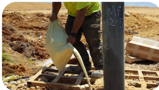
Pouring foam around a well casing