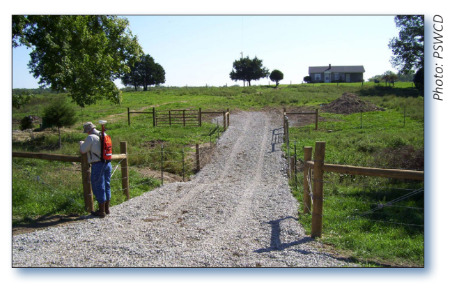
Figure 2. This stream crossing prevents cows from accessing the creek.

Implementing agricultural BMPs has resulted in a continual decline in pollutant levels in Deep Creek. The E. coli bacteria data collected at monitoring station 2-DPC005.20 shows a decreasing trend in bacteria exceedance rates. In the 2007–2012 assessment period, 12 out of 82 samples (15%) exceeded E. coli WQS, and in 2009–2014 assessment period, 11 out of 113 samples (less than 10%) exceeded E. coli WQS (Figure 3). These exceedance rates are significantly lower than the 34% found during 1995–2000 period. As a result, in 2016 DEQ removed an 11.55-mile-long segment of Deep Creek from the list of impaired waters.