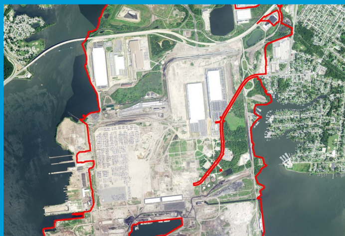
An aerial view of the Sparrows Point Site in 2018.

The Sparrows Point Site, a 3,100-acre peninsula reaching into the Baltimore Harbor in Baltimore County, Maryland, was home to one of the world's largest steel manufacturing operations for more than 100 years. Steel manufacturing created thousands of jobs, but also resulted in significant contamination at the facility and in offshore areas. Beginning in the mid-1990s, the EPA and the Maryland Department of the Environment (MDE) were actively involved in addressing the contamination under RCRA. A variety of owners and operators were also involved through judicial and bankruptcy proceedings.