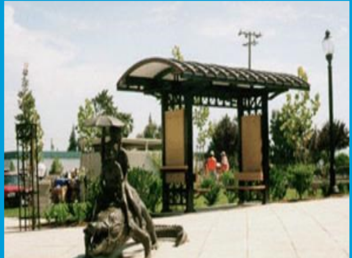
A sculpture and waiting area at a new company campus on site.

In Mountain View, the Middlefield-Ellis-Whisman Superfund Study Area (or MEW Site) is comprised of three Superfund sites: Fairchild Semiconductor Corp., Raytheon Company, Intel Corp., several other facilities and portions of the former Naval Air Station Moffett Field. In 2017, the EPA and DOJ entered into a BFPP agreement with Warmington Fairchild Associates LLC to accelerate cleanup and significantly reduce subsurface contamination in a short timeframe at three parcels in the MEW Site. The BFPP agreement also ensured residential redevelopment in a manner protective of human health for future occupancy. Upon completion, the redevelopment at the MEW Site will include 22 townhomes and four detached homes. The Fairchild Semiconductor Corp. site is now in reuse as an office complex for a major multi-national technology company. The Raytheon Company site currently hosts various business and commercial offices, light manufacturing facilities and the headquarters for an information security, storage and systems management solutions company. The Intel Corp. site is currently home to commercial businesses and headquarters for a software company.