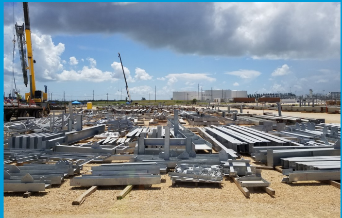
An on-site storage and laydown facility.

The 140-acre Tex Tin Corp. Superfund site is located near the banks of Galveston Bay in Texas City, Texas. Historical smelting operations contaminated soil, sediment and groundwater with hazardous chemicals. Cleanup at the site addressed contaminated groundwater, soil and sediment, waste piles, wastewater treatment ponds, acid ponds and slag piles. After cleanup, the EPA awarded the site a Superfund Redevelopment grant in 2001.