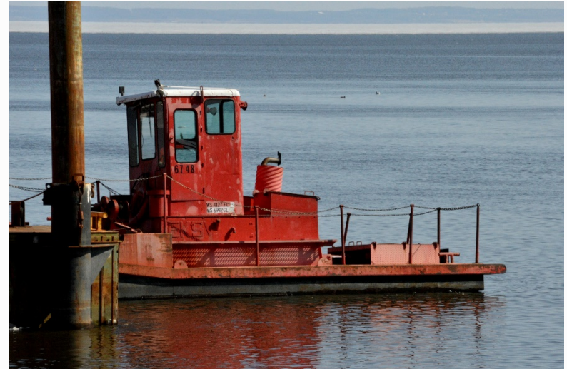
Traditional navigable waters include those waters used for interstate commerce, like Lake Winnebago in Wisconsin.