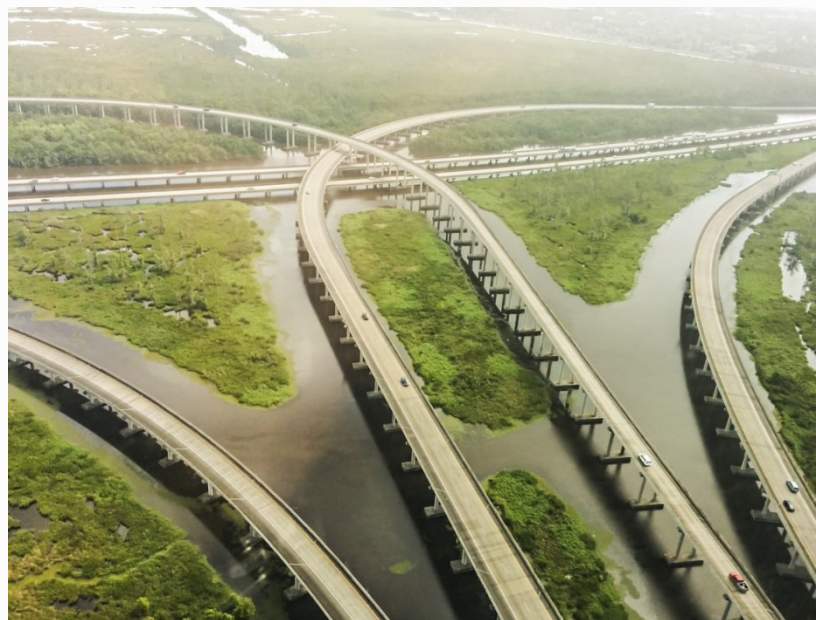
Adjacent wetlands include wetlands with manmade structures that allow for a direct hydrologic surface connection to an (a)(1)-(3) water in a typical year, like these wetlands in the Mississippi river Delta region of Louisiana.