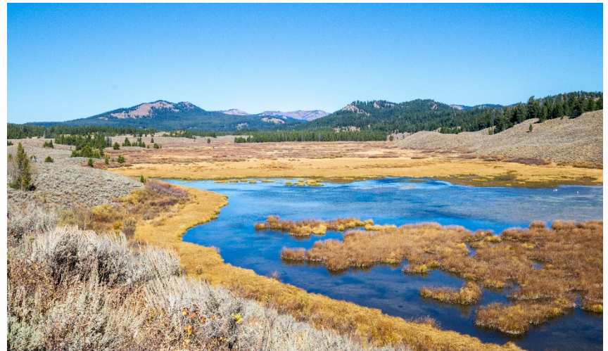
Lakes, ponds, and impoundments of jurisdictional waters include open bodies of surface water that contribute surface flow to a traditional navigable water, like Christian Pond in Wyoming.