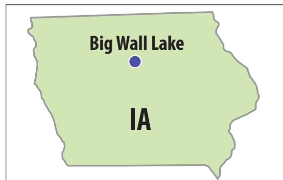
Figure 1. Big Wall Lake is in north-central Iowa.

In 1993 a large population of common carp moved into the lake during high-water events. When feeding, the carp uprooted and eliminated the lake's existing submerged aquatic vegetation (SAV) and continuously stirred up bottom sediment, which caused turbidity that blocked light and prevented the growth of new plants on the lake bed. Because the loss of SAV can degrade habitat and allow undesirable aquatic species to dominate the ecosystem, the suppression of SAV constitutes a violation of Iowa's narrative water quality criteria protecting against undesirable or nuisance aquatic life. A site assessment in October 2000 by staff from DNR and U.S. Environmental Protection