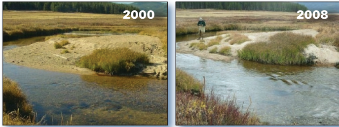
Figure 2. Bear Valley Creek, before (left) and after (right) livestock grazing was removed. This bar is gradually recovering as perennial vegetation becomes established.

riparian restoration project along Upper Bear Valley Creek. Volunteers planted native willows, sedges and grasses at 14 sites.