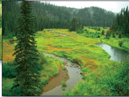
Figure 3. Middle Tepee Creek after reconstruction of meanders and revegetation, 2008.