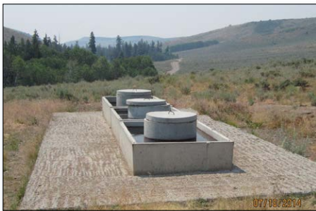
Figure 2. Project partners installed alternate water sources to keep livestock away from Shoshone Creek.

In July 2013, staff from the USFS' Sawtooth National Forest developed a land and resources management plan that describes the agency's water management goals. Even before developing this plan, the USFS was implementing projects to protect soil, water, riparian and aquatic resources. In 2004 the USFS built fences on the Rock Creek C&H Allotment to restrict grazing along the creek. In addition, the USFS placed boulders along the main road to prevent motor vehicle access to the creek.