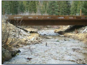
Figure 3. Partners replaced a forest road culvert (left) with a new bridge (right) over Meadow Creek. The bridge allows unimpeded fish passage and reduces road-related sediment loads.