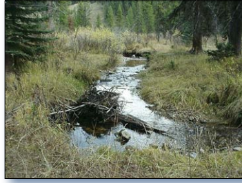
Figure 2. Livestock grazing in the riparian area caused damage in Meadow Creek (as seen on left, 2003). Partners installed fences to exclude livestock. Within two growing seasons, streambank vegetation had recovered (as seen on right, 2005).