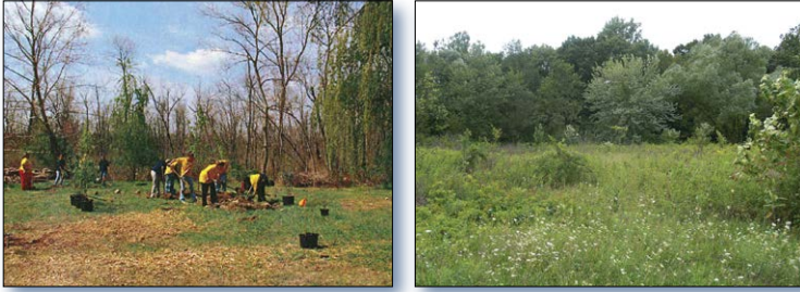
Figure 2. Volunteers planted trees in a riparian area in June 2005 (left). By August 2010 (right), a healthy riparian buffer had become established along this stretch of the Pequest River.

The Liberty Township Environment Commission, in cooperation with local partners, also installed an oil/sediment manufactured stormwater treatment device and eight stormwater inlet treatment filters treating stormwater runoff that discharged to Mountain Lake Brook, immediately below the discharge of Mountain Lake. Implementing these BMPs was part of a larger collaborative watershed approach that included watershed education and outreach components to expand awareness in the region. Partnership projects and community service opportunities were instituted by the New Jersey Department of Environmental Protection's (NJDEP's) AmeriCorps New Jersey Watershed Ambassadors Program during this period. A Watershed Ambassador, stationed at the NJRC&D office, assisted with implementing and maintaining riparian restoration projects, performing stream visual assessments and conducting numerous educational programs in the watershed. Pollutant loading reductions from wastewater treatment plants upstream of the waterbody in response to the development of a TMDL were also instrumental in attaining water quality standards in the waterbody.