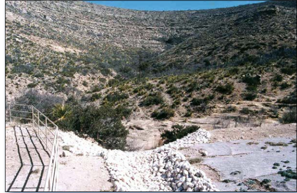
Figure 3. Restoration project efforts included adding fencing and armoring drainage ditches.

road and parking lot (Figure 3). They installed pipe fencing around the picnic areas to discourage access to the unauthorized trails and to protect the riparian area from erosion. In addition, the partners installed a new water supply well and upgraded the restroom facilities; these improvements have resolved the sanitation issue and reduced bacterial loading. Volunteer site hosts are stationed in RVs onsite to monitor the day-use area to ensure success. This project was a good example of interagency cooperation on resource management, as both agencies came together on their planning efforts to upgrade the recreation area and improve water quality.