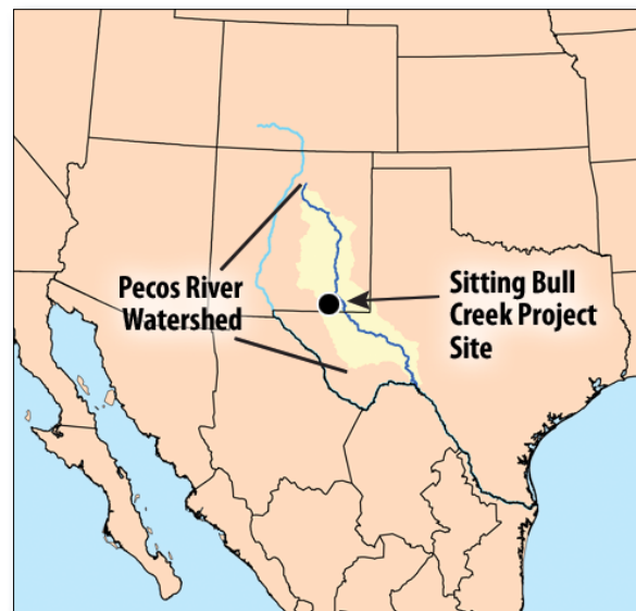
Figure 1. Sitting Bull Creek is in the Pecos River watershed in New Mexico.

Staff from the NMED Surface Water Quality Bureau (SWQB) identified the probable sources of Sitting Bull Creek's water quality problems as dispersed recreation, improper sanitation, grazing and roads. The key pollution sources were addressed before a TMDL could be developed.