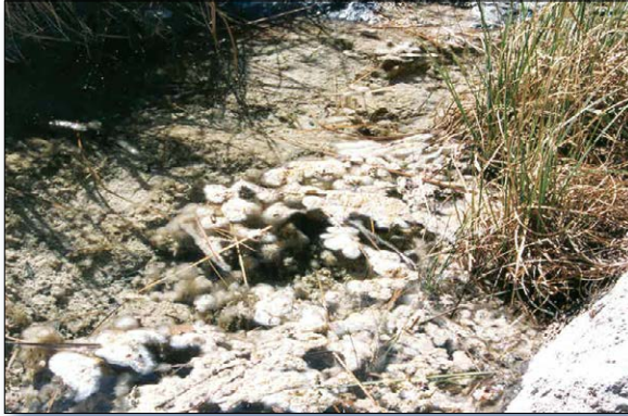
Figure 2. Nuisance algal blooms were common in pools below Sitting Bull Falls in the mid-1990s.