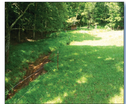
Figure 2. A farmer installed fencing to prevent livestock from accessing this Stock Creek tributary.

Funding sources for Stock Creek watershed improvements included the CWA section 319 program, the state's Agricultural Resources Conservation Fund (created through Tennessee's real estate transfer tax), NRCS Farm Bill funding programs and matching funds from landowners. A CWA section 319 grant of $20,000 was awarded to the Ijams Nature Center for the Stock Creek Watershed Restoration Plan. Funding for BMPs included CWA section 319 grant pool funds ($30,550 in cost share, $21,833 of which was contributed by landowners), the Agricultural Resources Conservation Fund (provided $17,036 in cost share), and landowners ($23,140).