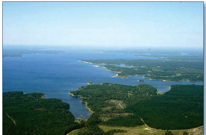
The Tenaha Creek Arm of the Toledo Bend Reservoir is in Shelby County, Texas.

Toledo Bend Reservoir is designated for high aquatic life use in freshwater. To meet the state's water quality standards for this designated use, Toledo Bend Reservoir must maintain a 24-hour average DO concentration above 5.0 milligrams per liter (mg/L), and a 24-hour minimum sample concentration above 3.0 mg/L. The Tenaha Creek Arm of Toledo Bend Reservoir (segment 0504 _ 06) first appeared on the state's CWA section 303(d) list of impaired waters in 2000 for not meeting the standard for DO.