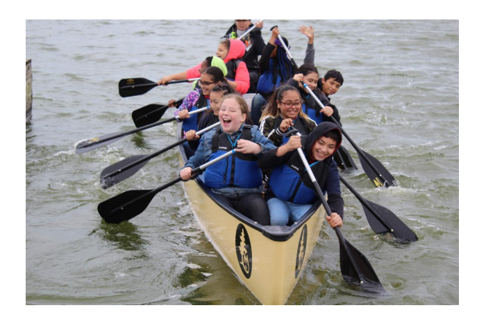
Students enjoy paddling as part of Dunes Learning Center's watershed education experiences.

In its seventh year in Northwest Indiana, Wilderness Inquiry's Canoemobile is going strong. This fall thousands of students and residents experienced their urban waters from the seat of a 24-foot voyageur canoe. Urban Waters partners contributed activities on environmental and cultural topics.