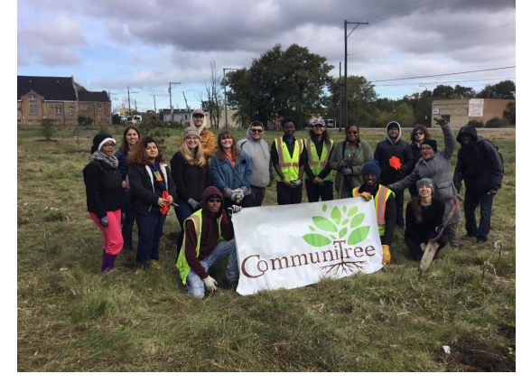
IUN students and SCA planted 25 native fruit trees at the Brother's Keeper garden in Gary.