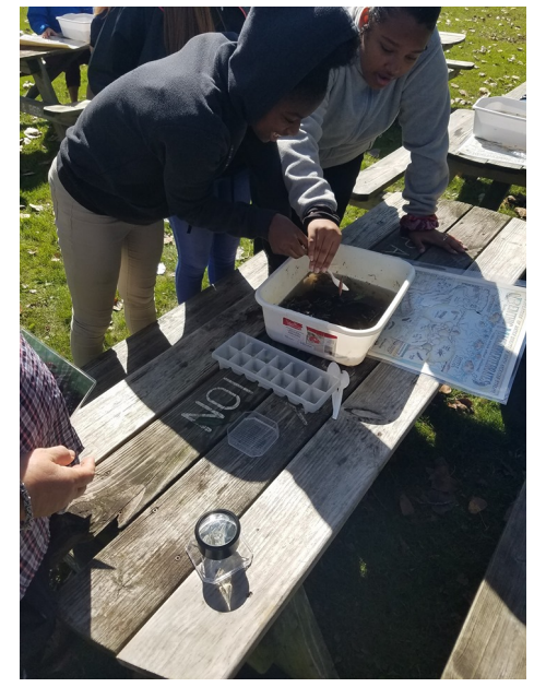
Students examine benthic macroinvertebrates as part of LaPorte County Soil and Water Conservation District's Trail Creek Week.