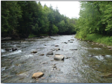
Figure 2. The WBOR before (top: pre-2009) and after (bottom: post-2012) implementation of restoration efforts.