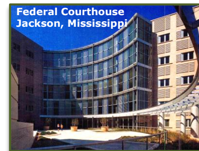
Federal Courthouse Jackson, Mississippi

An Environmental Workforce Development and Job Training grant is used to recruit, train and place under-employed and unemployed residents in the environmental field. Training programs may focus on hazardous and solid waste management, wastewater treatment, cleanup technologies and environmental health and safety. Eligible recipients can receive up to $200,000 to conduct training over a two-year period.