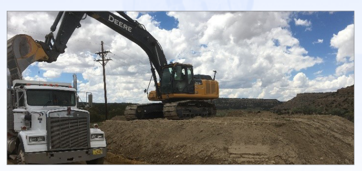
Arrow Indian Contractors, a USEPA contractor, removes 10,000 cubic yards of contaminated soil at the Quivira mine site.

Funds are available to begin the assessment and cleanup process at 22 mines, approximately 26% of the mines in the Eastern AUM Region, including 11 of the 13 priority mines. USEPA continues to look for companies responsible to assess and clean up the remaining mines in this region.