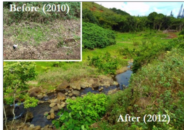
Figure 2. Riparian restoration efforts removed invasive species and improved water quality of He'eia Stream.

HoK volunteers provided community outreach and education through community work days, hosting homeowner workshops focusing on personal fertilizer and pesticide use, direct mailing to homeowners, and curriculum development for classroom education. Additional erosion control and restoration efforts by other groups are currently ongoing in the lower riparian, wetland and fishpond areas.