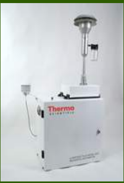
Thermo Partisol 2025-D Sequential Sampler

Thermo Scientific Dichotomous Partisol Plus 2025-D sequential samplers have recently been approved as FEMs for PM 10 , PM 2.5 and PM 10-2.5 mass. Before using your 2025-D sequential dichot sampler for any of these pollutants, make sure that it is and FEM. How do you confirm this? FEM samplers should have an FEM sticker supplied by the ven-