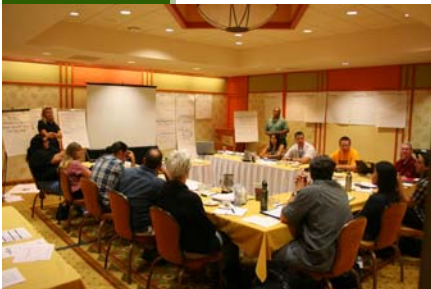
August PQAO Workshop Participants

Since the 2006 inclusion of a new definition for a primary quality assurance organization (PQAO) in 40 CFR Part 58 Appendix A, states with many smaller local monitoring organizations have been consolidating to fewer PQAOs. In some cases, tribal monitoring organizations have consolidated with state PQAOs.