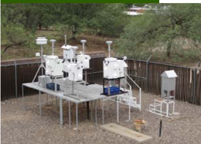
Pima County NCore Site

Pima Ambient Air Monitoring Program's (AAMP) Children's Park NCore station came to the attention of Region 9 months before a Technical System Audit took place in September 2011, when a question was posted by a Primary Quality Assurance Organization (PQAO) on how to