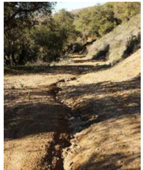
The La Jolla Band of Luiseño Indians is using EPA funding to stabilize Cedar Creek Road. The road is a high priority for management measures because erosion is likely contributing sediment, metals, and hydrocarbons to the San Luis Rey Watershed.

For more information, please refer to EPA Region 9’s FAE Handbook for Indian Tribes at