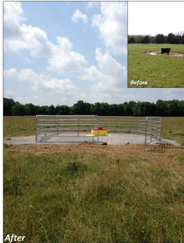
Figure 2. Alternative watering facility and heavy use area installed near Concord Creek.

The Harpeth Conservancy was awarded three CWA section 319 grants for protection and restoration efforts in the Harpeth River, of which $119,648 was invested in BMPs in the Harpeth River Headwaters watershed (including Concord Creek). Partners that assisted the Harpeth Conservancy included the Center for Watershed Protection, U.S. Department of Agriculture (USDA) Natural Resources Conservation Service (NRCS), the Tennessee Valley Authority, U.S. Geological Survey, and Rutherford County Soil Conservation District (SCD). Tennessee's ARCF program has contributed $88,494 for the implementation of agricultural BMPs in the Harpeth River Headwaters watershed. Rutherford County SCD and USDA NRCS partnered with TDA to assist with practice design and installation.