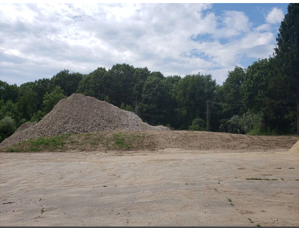
Former Nursing Home Site Cleaned Up.

“The Homestead project places a significant property along the Town’s busy Route 1 corridor back into active and productive use. The funding provided by EPA and SMPDC to support assessment and cleanup of the site was critical to its redevelopment, which will benefit Town residents, visitors, and taxpayers for years to come.”