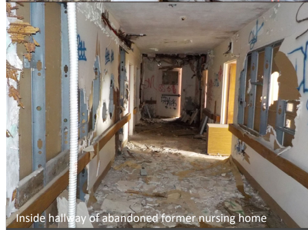
Inside hallway of abandoned former nursing home