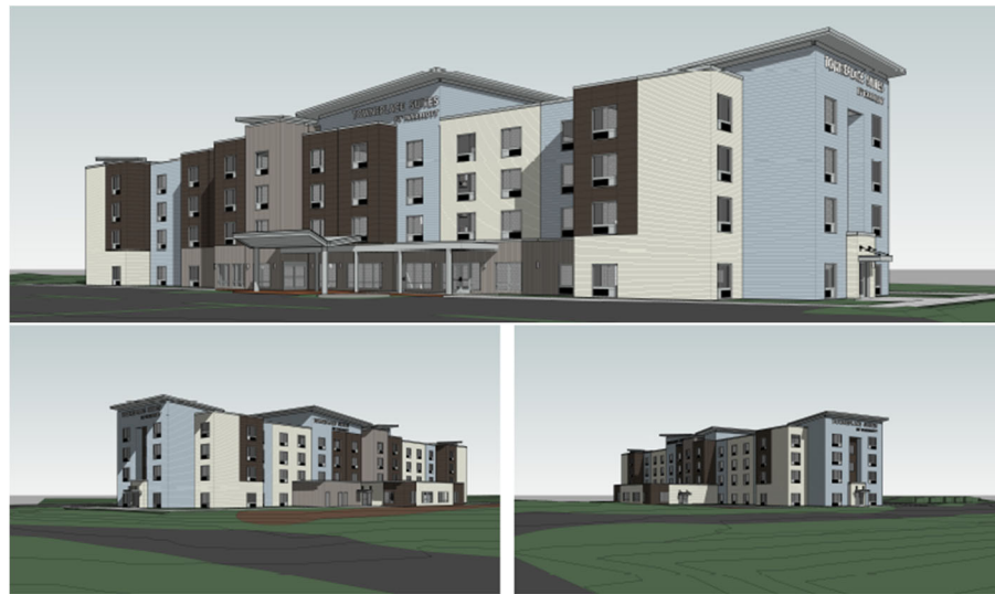
Renderings of future TownPlace Suites Marriott Hotel

This abandoned former nursing home is a prime example of how the EPA Brownfields program can provide health, environmental, social and economic benefits to a community. The cleanup, removal and reduction of exposure to contamination creates a more sustainable and healthy environment, while spurring positive economic development.