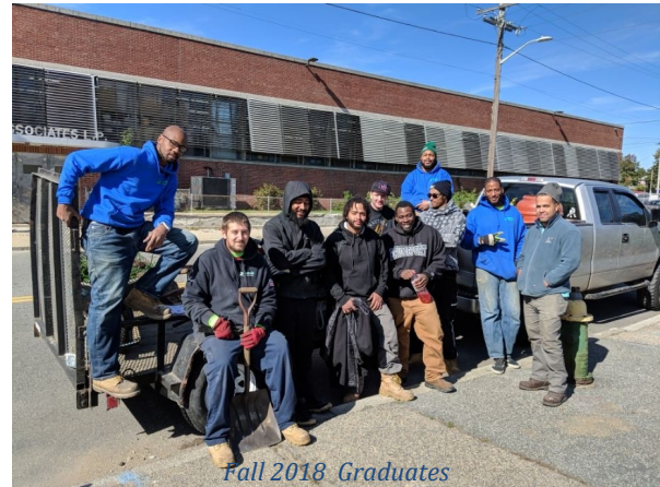
Fall 2018 Graduates

Groundwork RI's partnership with Children's Friend is an example of the kinds of strong partnerships Groundwork RI nurtures within its job training program. Children's Friend improves the well-being and health of Rhode Island's most vulnerable children and their families. Aware that fathers of children in its Head Start program need better jobs and job training, Children's Friend created a paid job training program specifically for this group. The organization works under the belief that fathers who participate in the job training program will also improve the role they play in their children's lives. To this end, Children's Friend provides workshops such as, "A Father's Impact on Child Development", "Helping Your Child Succeed in School and in Life", and "Parenting - A Father's Role."