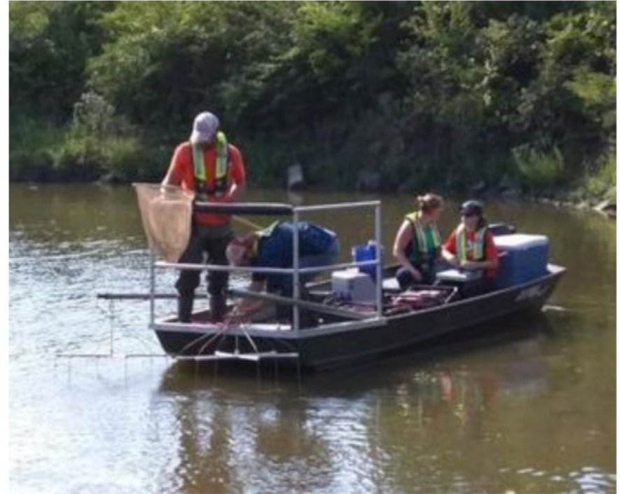
Collection of fish from a pond at the Kansas City Municipal Farm.