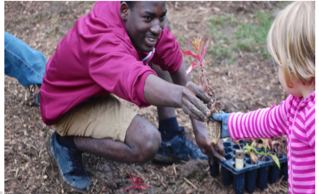
Plaster Creek partners planting in the watershed.

https://www.nfwf.org/programs/five-star-and-urban-waters-restoration-grant-program