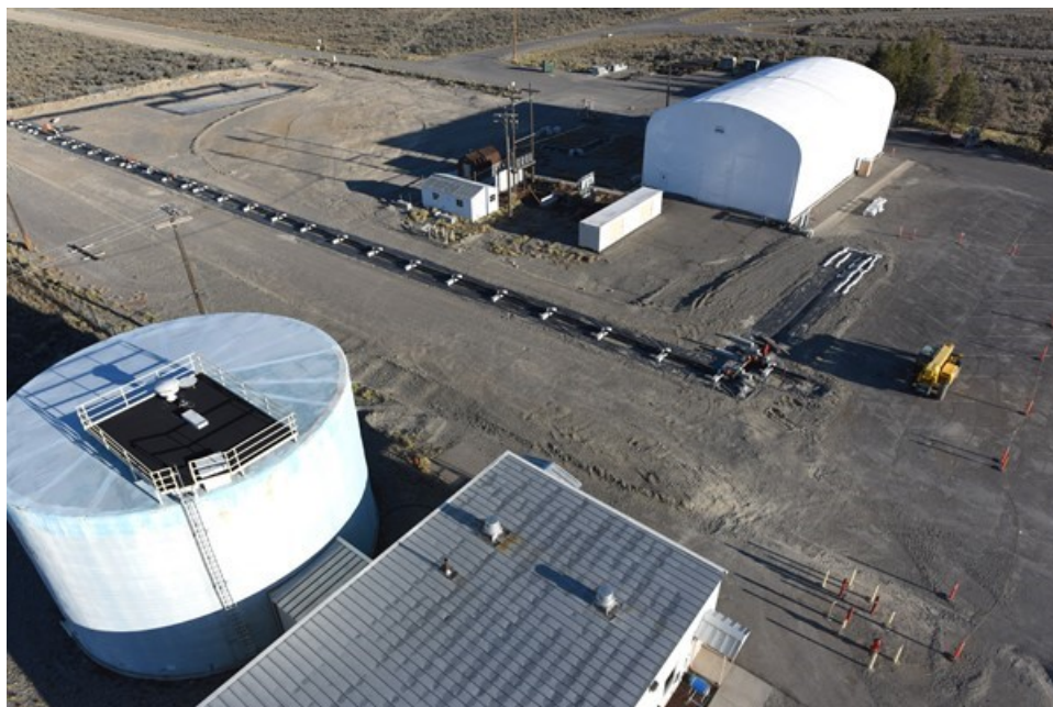
Figure 4: Aerial view of the Water Security Test Bed

Initial HSRP research efforts have focused on developing prototype decision-support tools for drinking water systems. HSRP will focus on expanding these tools to “all hazards”, validating their results with real-world data, and using the tools in case study applications with partner drinking water utilities.