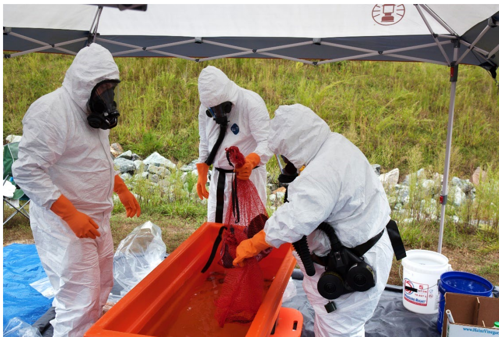
Figure 6: Testing of on-site solid waste treatment approaches.