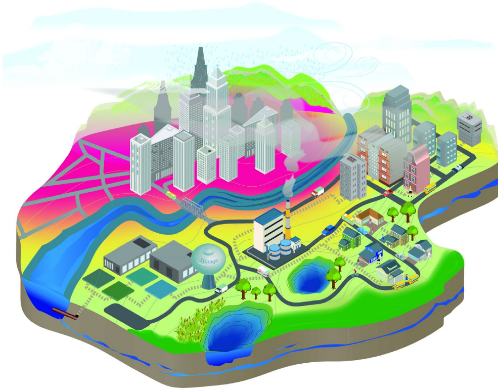
Figure 1: Schematic Overview of a Wide-Area and Water-System Contamination Incident for Scenario-Based Resilience Planning

A disaster that results in wide-spread chemical, biological, radiological, and nuclear (CBRN) contamination over a large outdoor area, or throughout a water and wastewater system, presents a daunting challenge to EPA, state, tribal and local responders in carrying out their responsibilities. Once released into the environment, contaminants can spread via natural forces and human activities. The potential for cross-media spread of contamination is depicted in Figure 1 and represents a sample of the complex scenario that large-scale contamination incidents present to communities.