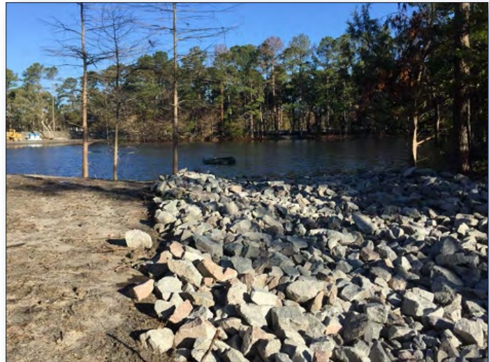
Figure 2. The stormwater pond includes an outlet drain and an emergency overflow structure.

The preliminary estimate of fecal coliform load reductions for this project, in combination with other proposed best management practice (BMP) retrofits in the Battery Creek Watershed Management Plan, was 12 percent. Additionally, there was an expected freshwater reduction of approximately 4 percent. Shortly after construction, the area experienced a significant and intense rainfall event with more than 4 inches of rainfall within the watershed over a 36-hour period during an extremely high tide cycle. The pond was evaluated during and after the storm event, and was found to perform as designed, with no water overtopping the banks. The project was promoted to the public and stormwater personnel through subsequent professional workshops and media covered events.