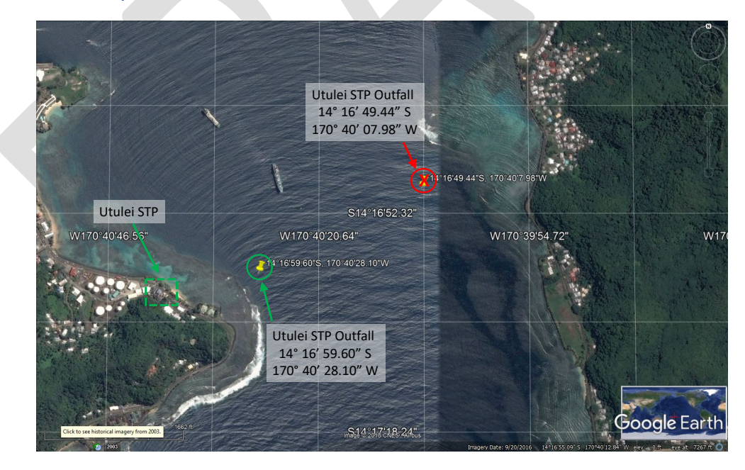
Figure 2: Map of Utulei STP and outfall (locations in green). Reprinted from discharger's 2018 submission of revised outfall coordinates. Diffuser location did not change, but use of old coordinate system (NAD 27 datum) led to inaccurate (red) position relative to physical coastlines.