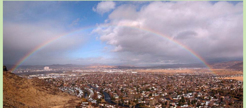
Washoe County, NV