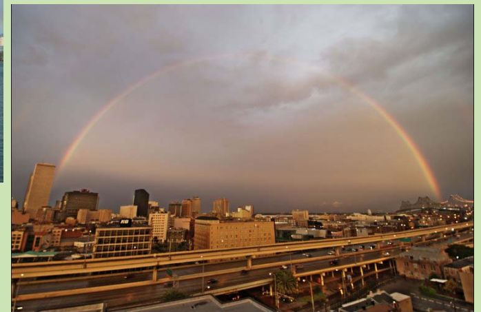
New Orleans, LA