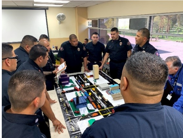
Mexicali Training, March 2020

5 th Phase Training and Consulting was subcontracted by the EPA to bring two sessions of Incident Command and Hazardous Materials training to Mexicali, Baja California to enhance emergency responder expertise. Each session consisted of Incident Command System (ICS) Training, First Responder Awareness (FRA) Trainings, and a 24 hours First Responder Operations Course (FRO).