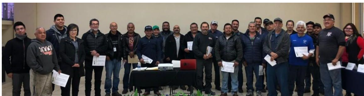
Workshop on best practices for dismantling junk vehicles, March 2020

Nogales Municipality's Secretaría de Desarrollo Urbano y Ecología (Secretariat of Urban Development and Ecology in Sonora) is reducing land contamination derived from various sources, among them clandestine dumping and junkyards with support of two Border 2020 grants.