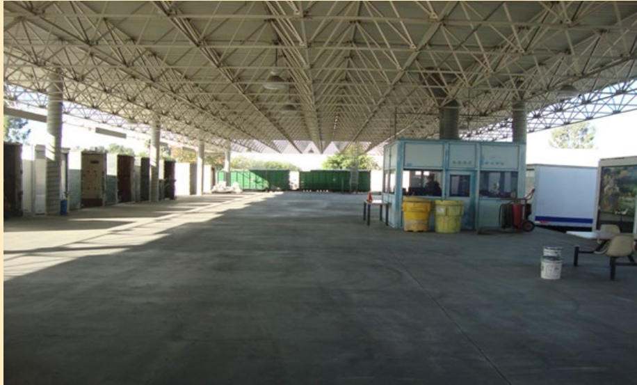
U.S. Customs and Border Protection Otay Mesa Port of Entry truck and vehicle inspection area

The mission of DTSC is to protect California's people and environment from harmful effects of toxic substances by restoring contaminated resources, enforcing hazardous waste laws, reducing hazardous waste generation, and encouraging the manufacture of chemically safer products. DTSC, in a partnership with the County of San Diego Hazardous Management Division, conducts border truck stop inspections at the Calexico East and Otay Mesa Port of Entry.