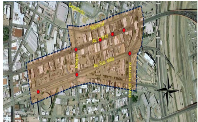
Figure 1. Paso del Norte Port of Entry project study area.

The project aimed to show how implementing this strategy would allow for a reduction in emissions due to a reduction of vehicle idling at the POE and foster compliance with rules and standards related to vehicular emissions.