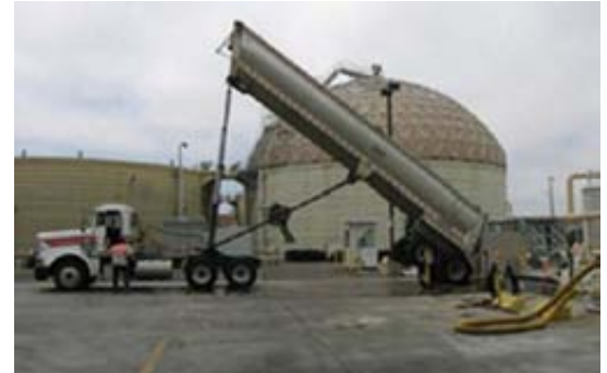
Food waste being unloaded at EBMUD Main Wastewater Treatment Plant. For more information on this project, visit http://www.epa.gov/region9/foodtoenergy .

The symposium is sponsored by the United States Environmental Protection Agency Pacific Southwest Region (Region 9), California Integrated Waste Management Board, Central Valley Regional Water Quality Control Board, California Department of Food and Agriculture, Western United Dairymen, Sustainable Conservation, California Association of Sanitation Agencies, Sacramento Municipal Utilities District, and the University of California at Davis.