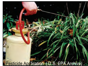
Pesticide Application

More detailed information on Region 9 Research Priorities, is available in divisional fact sheets