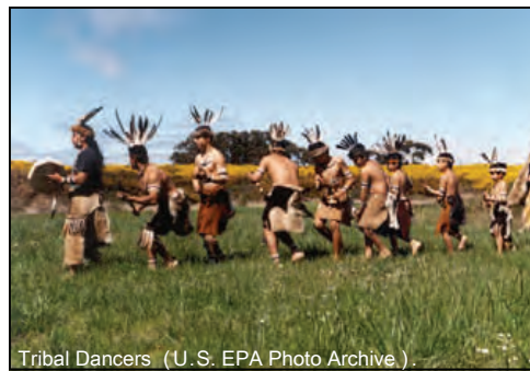
Tribal Dancers

The populations of Region 9 are among the most diverse in the nation and include large segments of population that are uniquely impacted by environmental pollution or which are underserved by basic environmental infrastructure. Our ecosystems are also uniquely diverse and varied from the rest of the nations. The science priorities and activities below reflect these unique characteristics and challenges facing Region 9